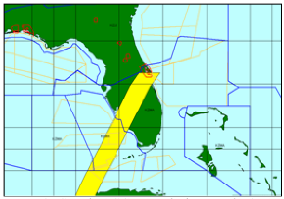
Figure 9: Sample AIS Space Vehicle Hazard NOTAM (Graphical Depiction)

Fig. 9 below, is a graphical depiction of the same AIS text NOTAM as in Fig. 8, with the hazard area graphically depicted and shaded in yellow. This notional graphical depiction could be used as the basis for developing an acceptable human factors-centric depiction suitable for flight deck implementation.