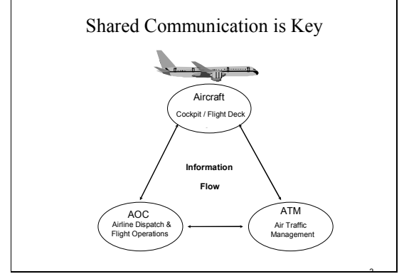
Figure 1. Shared situational Awareness between the Aircraft, the AOC Function, and ATM

Up to this point in time, the FAA was planning to rely only upon its traditional Notices to Airmen (NOTAM) system and the complex designation of Special Use Airspace (SUA) to separate space launches and reentries from other terrestrial air traffic. These NOTAMs were to be issued in conjunction with the space flight operations taking place in the National Airspace System (NAS) and in oceanic/remote airspace. In context, these NOTAMs would serve as a pre-flight briefing tool, but updated/revised NOTAMs would not be structured for rapid communications to flight crews for their in-flight use. However, the emergence of various robust data link technologies now permits the provision and use of data linked aeronautical information services (AIS) direct to the cockpit as well as the sharing of the same information with the air traffic management (ATM) function, with controllers, and with the airline's operational control function (AOC), as shown in Fig. 1 below.