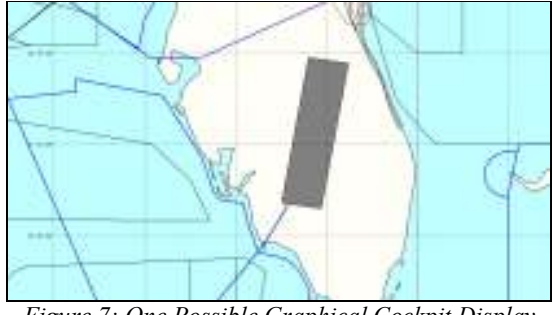
Figure 7: One Possible Graphical Cockpit Display Presentation of a Space Debris Field

Then, during the actual space vehicle flight, tracking or telemetry data, perhaps based upon air-to-ground Automatic Dependent Surveillance-Broadcast (ADS-B) data received from the space vehicle, would be used to describe its actual vehicle path along with its planned path in the form of projected trajectory change points (i.e., programmed and actual trajectory waypoints). If a hazardous situation should occur involving the space vehicle, its last known position and the corresponding estimate of the affected airspace that may contain debris hazardous to aircraft could be uplinked to all aircraft in the vicinity. An example is shown in the following figure.