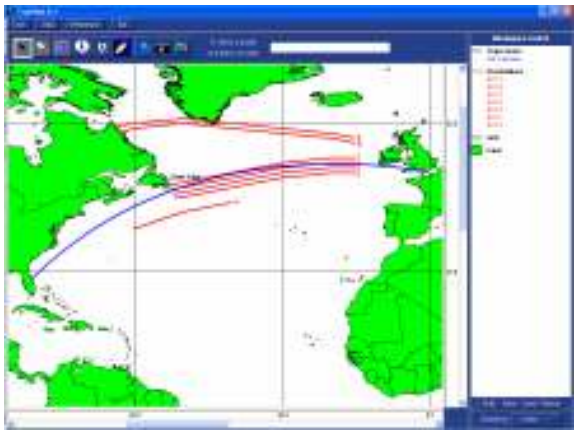
Figure 3: Example Ascent Trajectory of the Planned NASA Orion Space Vehicle

Additionally, by 2015, NASA plans to introduce a new space vehicle (named Orion) that could impact commercial flight operations in domestic as well as oceanic airspace. This includes the vehicle's launch phase which could influence commercial flight operations over the North Atlantic. Fig. 3 shows an example ascent trajectory to the ISS, plotted in blue over an example set of air traffic North Atlantic Tracks, plotted in red. A malfunction during launch could cause the vehicle or its debris to fall through this airspace.