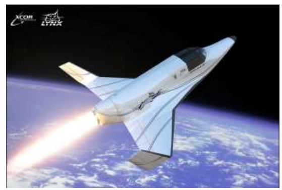
Figure 2: XCOR Lynx Reusable Suborbital Rocket

vehicle unveiled recently that is planned to begin suborbital flights from Mojave, CA in 2010. Upwards of two flights per day are planned, with proposed operations requiring large tracts of airspace to be NOTAMed as "off limits." Since space vehicle operations will initially be conducted from launch sites in California and New Mexico, it is expected that a significant number of commercial and general aviation flights operating in the southwestern U.S. will be adversely affected unless appropriate procedures and mitigations are developed, validated, and implemented.