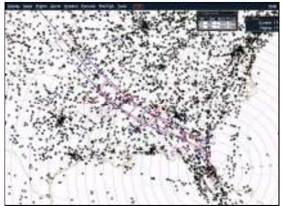
Figure 5: Traffic Situational Display Depicting Shuttle Reentry Trajectory and Traditional Air Traffic

to a Shuttle reentry, the FAA uses its Shuttle Hazard Area to Aircraft Calculator (SHAAC) tool to predict the size and locations of potential hazard areas along the Shuttle's planned reentry trajectory. These hazard areas are then graphically depicted and distributed to the impacted air traffic facilities for display on air traffic tools, such as a Traffic Situational Display (TSD) shown in Fig. 5.